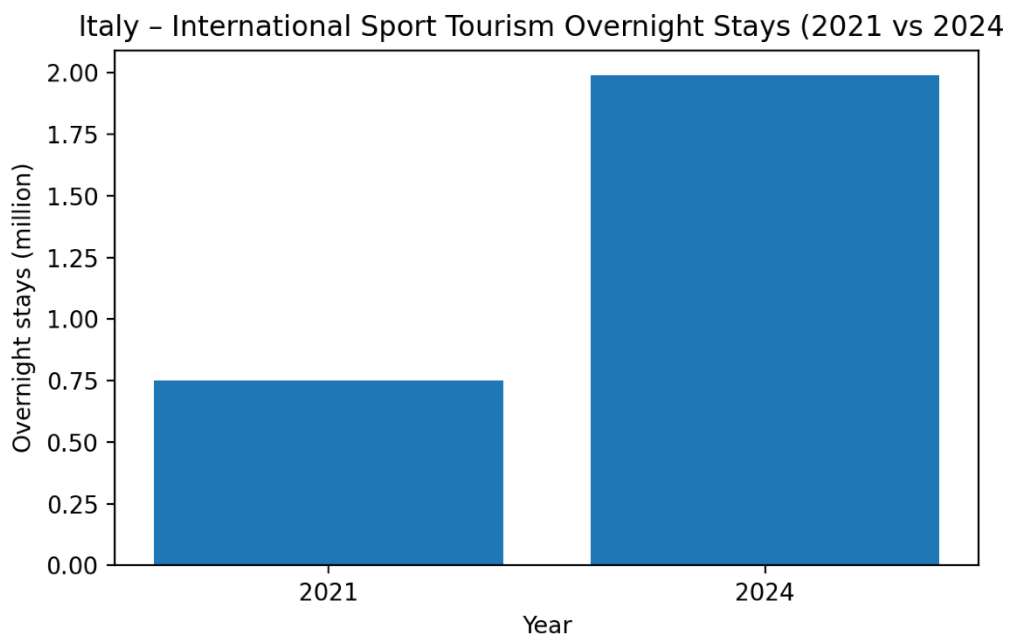
Figure 3. International sport tourism overnight stays in Italy (2021 vs 2024) Comparison of the number of overnight stays generated by international sport tourists in Italy in 2021 and 2024.